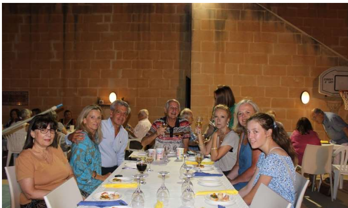
a few of the guests at the evening

This event was well organised, credit to Lion President, his wife and other Lions. All those present complimented them for organising this event. The end result was fantastic as the sum of Euro 2565 was raised. This sum is earmarked