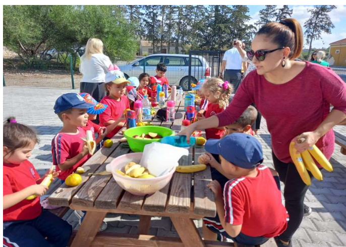
Children being served lunch

We are now glad to know that Nicosia Pandora Cyprus Lions implemented the Dikmen Primary School improvement project with the cooperation of the Ministry of Education, the Mayor of Dikmen and the Dikmen Elementary School Family Association.