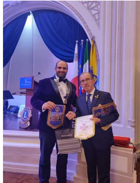
Lions Sliema and Sciacca Host Presidents exchanging bannerettes

As I have mentioned numerous times, I've adopted the theme of hope. When there is nothing left, hope remains. Never deprive anyone of hope! It can be all that they have left!