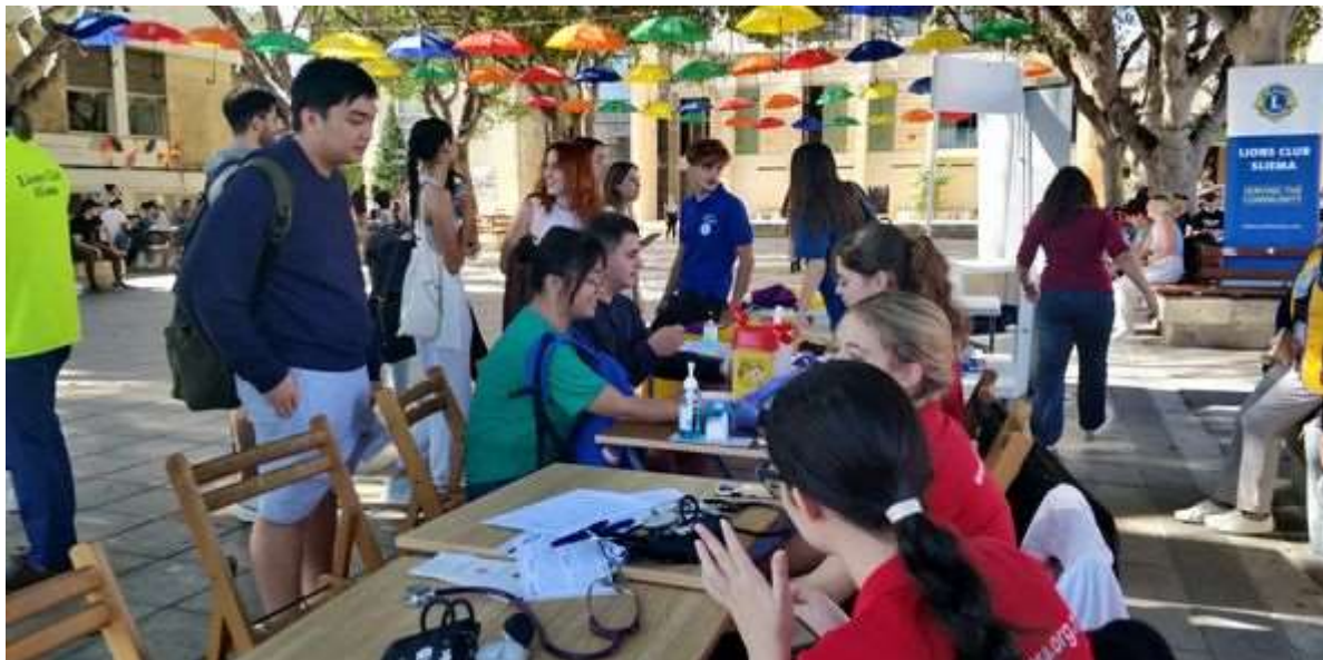
Students lining up for diabetes testing

November 14 has been designated as "World Diabetes Day" since it is the birth anniversary of Fredrick Banting, who along with Charles Best discovered insulin. In 1991, the day marked his 100 th birthday anniversary and hence the