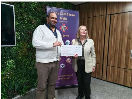
OnePlus 11 5G